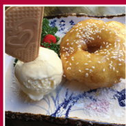
Toffee Pineapple (2) served with ice cream £5.50