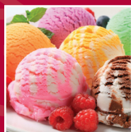
Ice Creams * Vanilla * Chocolate * Mint Chocolate * Maple Walnut £5.00