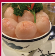
Fresh Lychee £4.50