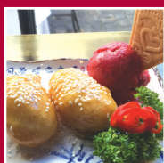
Toffee Banana (2) served with ice cream £5.50