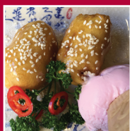
Toffee Apple (2) served with ice cream £5.50