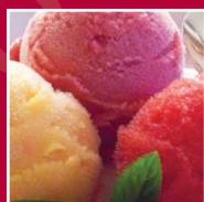
Sorbets * Lemon * Raspberry & Strawberry * Mango & Passion Fruit £5.00